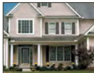
TrimFX ® Decorative Vinyl Trims

Read our full warranty for details. They are available from any KP distributor or on our website at www.KPproducts.com