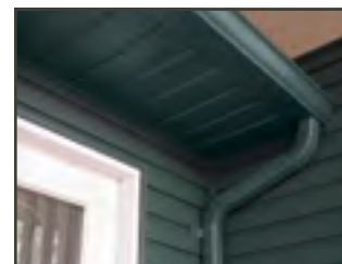
Aluminium Trims & Accessories