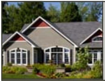
TrimFX® Decorative Vinyl Trims

We work hard to ensure customer satisfaction with a limited lifetime warranty. Read our full warranty for details. They are available from any KP distributor or on our website at www.KPvinylsiding.com