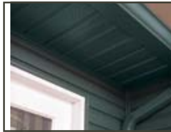
Aluminium Trims & Accessories